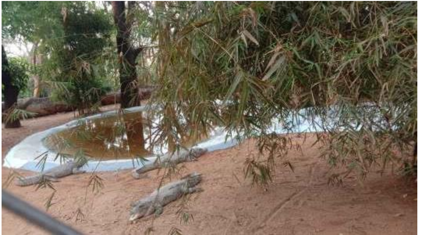
Zoo Park in Horsley Hills